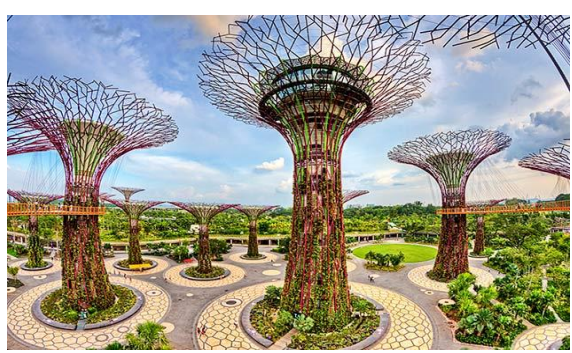
Gardens By The Bay LJ