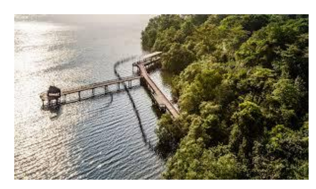
Sungei Buloh LJ