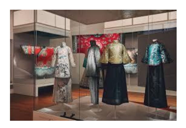
Asian Civilisations Museum