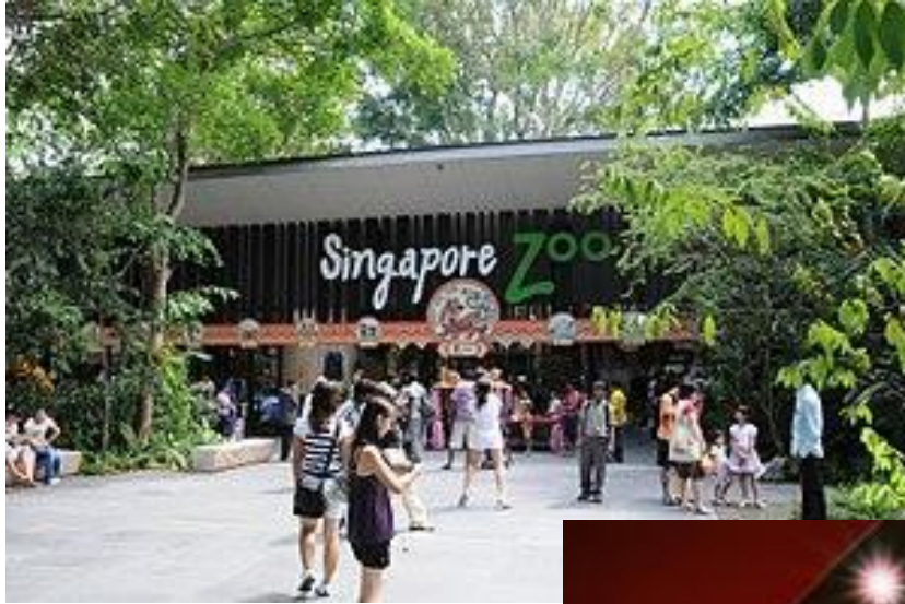
Singapore Zoological Garden