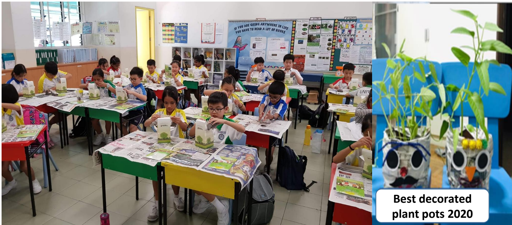
Best decorated plant pots 2020