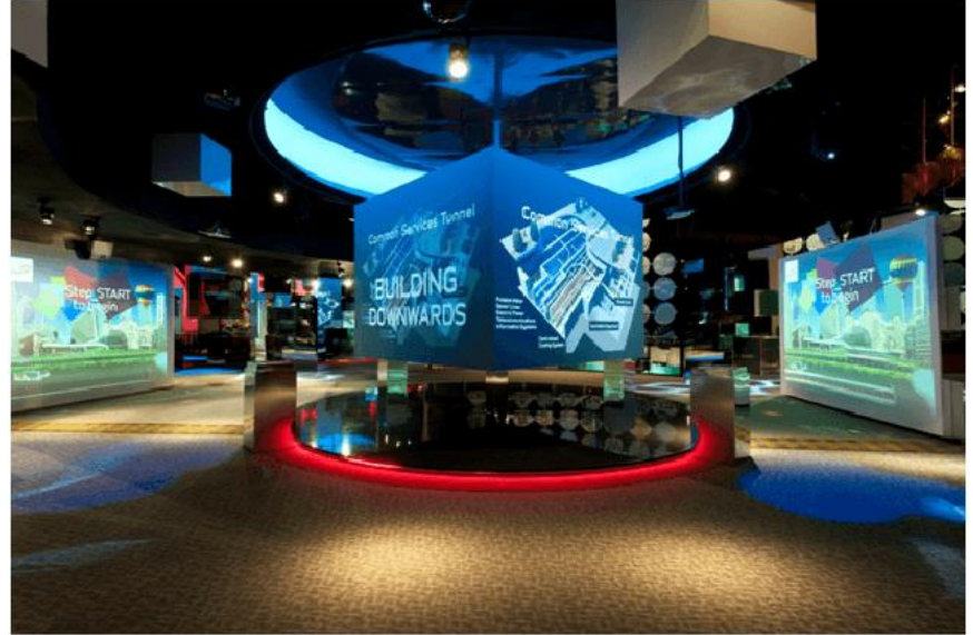
Singapore Discovery Centre Kreta Ayer Heritage Gallery