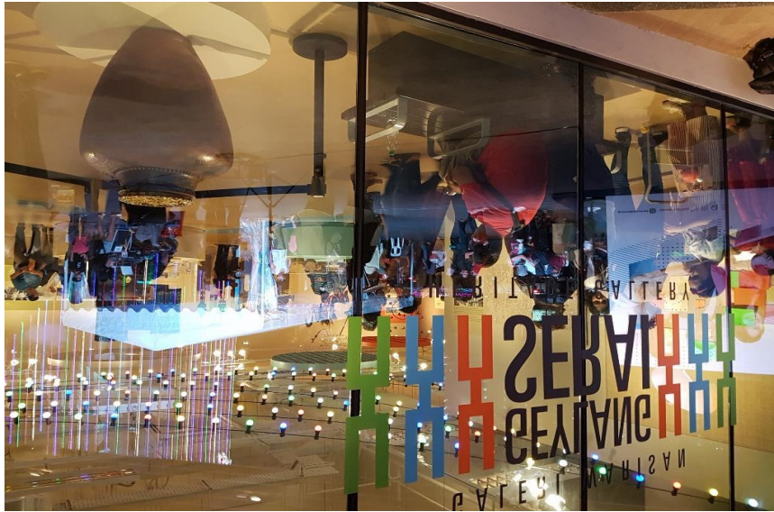
Geylang Serai Heritage Gallery